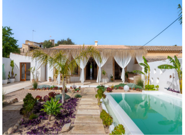
Beautiful villa with pool in Establiments