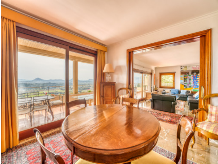
Dining area with sea views