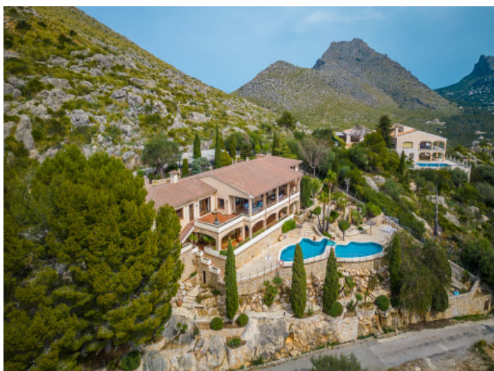
View to the villa