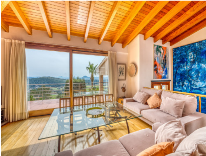
Relax with amazing views