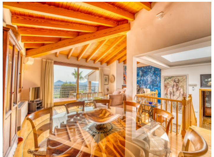
Living and dining area on the upper floor

All information is correct to the best of our knowledge. Errors and prior sale excepted. This prospectus is purely for information purposes. Only the notarized deed of sale is legally binding.