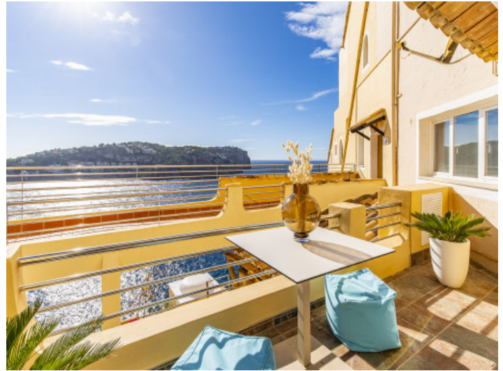
Gorgeous sea views from the balcony