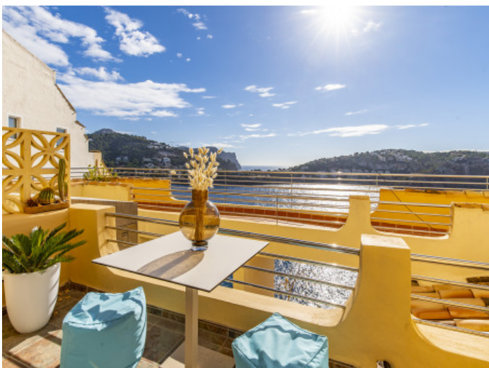
Views over the sea from the balcony