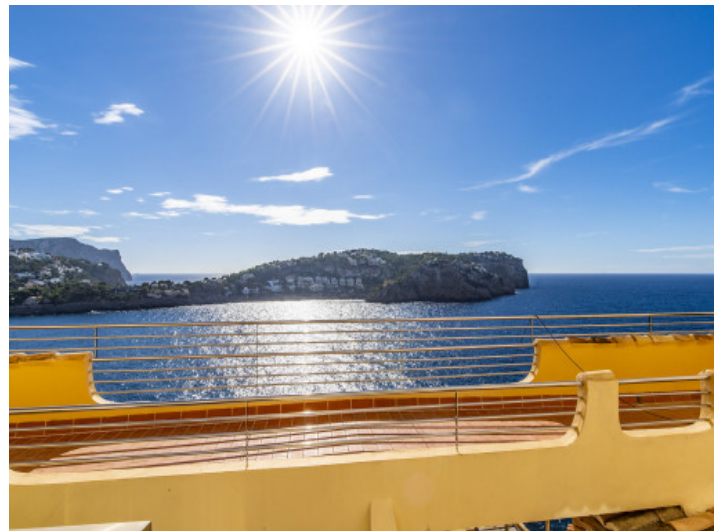
Apartment with private sea access