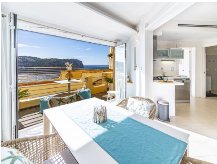
Dining area with mediterranean sea views