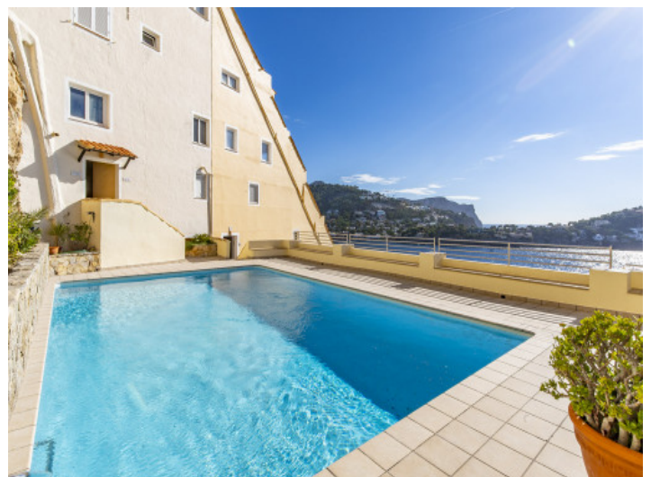
Community pool is surrounded by a terrace

All information is correct to the best of our knowledge. Errors and prior sale excepted. This prospectus is purely for information purposes. Only the notarized deed of sale is legally binding.