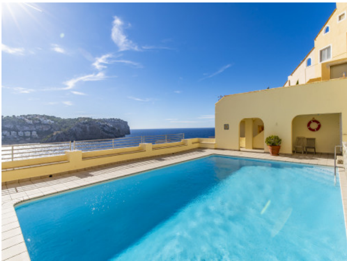
Community pool with mediterranean sea views