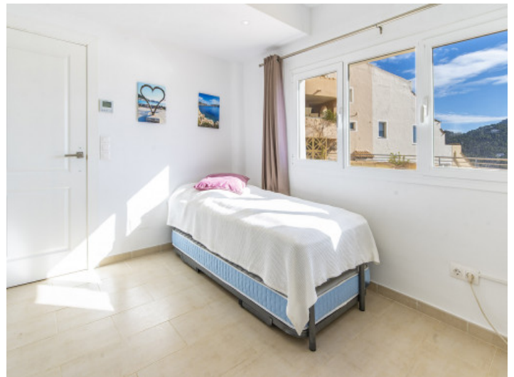
One of two bedrooms