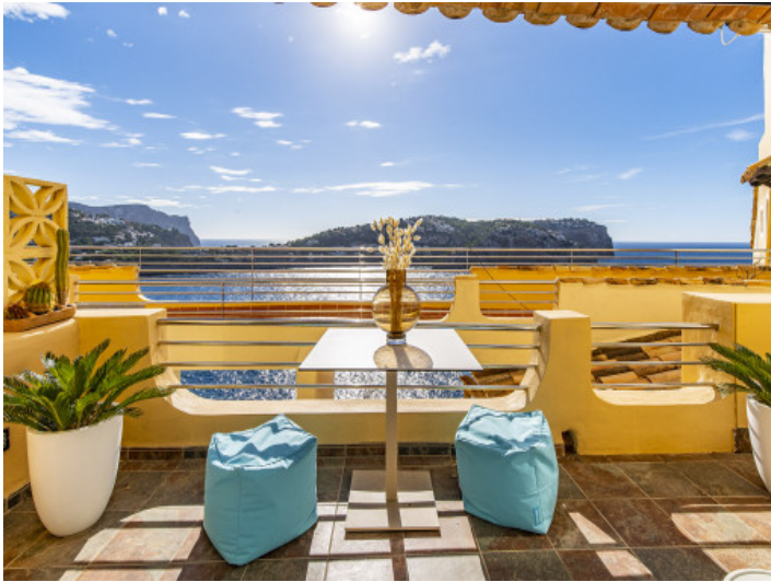
Fantastic sea views