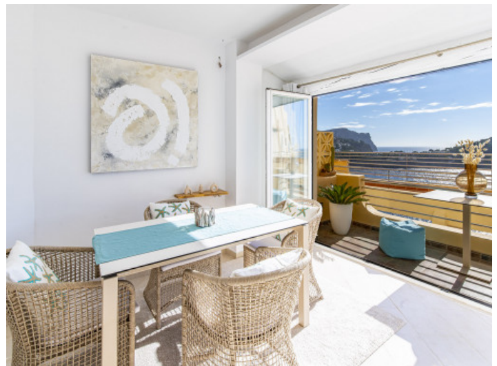
Dining area with balcony access

All information is correct to the best of our knowledge. Errors and prior sale excepted. This prospectus is purely for information purposes. Only the notarized deed of sale is legally binding.