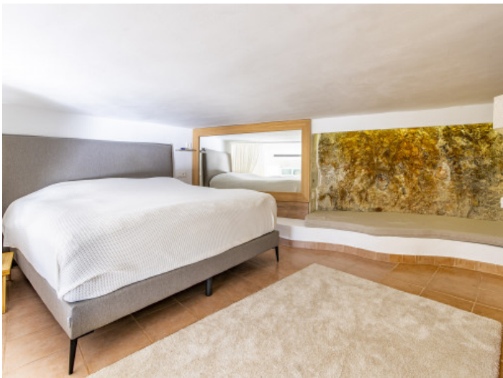
Mediterran sea views from the bedroom